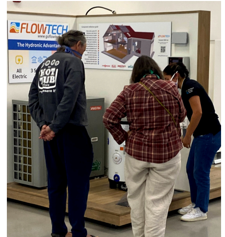
FlowTech's demonstration booth and training facility at the Sonoma Clean Power Advanced Energy Center