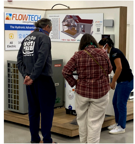
FlowTech's demonstration booth and training facility at the Sonoma Clean Power Advanced Energy Center